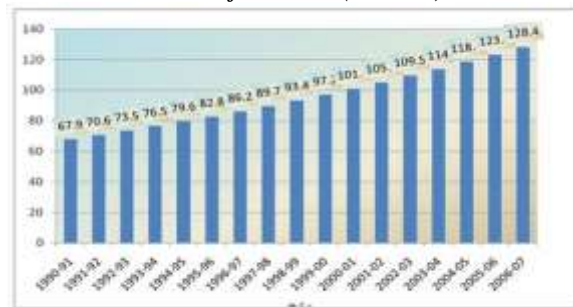
Chart No: 1 Number of SSI units ( in lakhs)